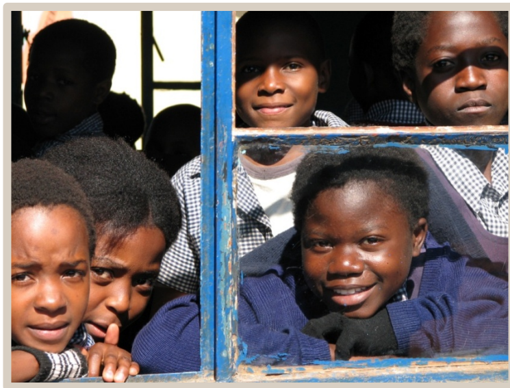
Girls at Zambian basic school